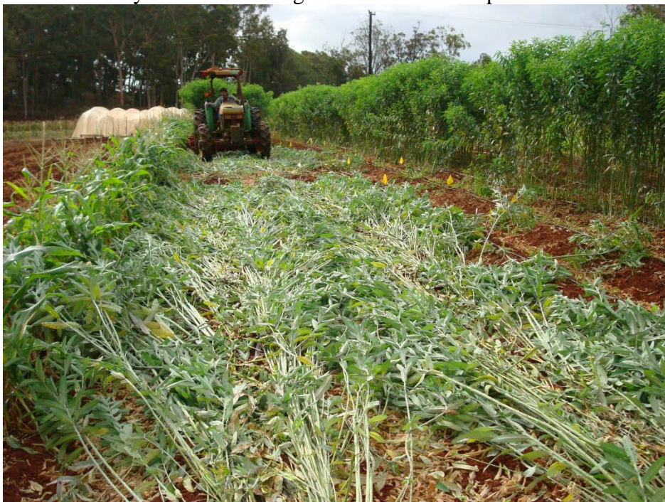
Fig. 3. Dense and compact sunn hemp mulch after one passing of roller crimper.