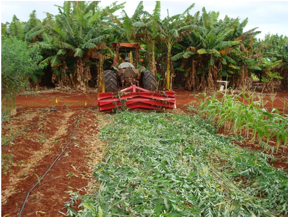
Fig. 1. A 8-foot long roller crimper (I & J Manufacturing, LLC., GAP, PA) hooked up to the back of a 60 horse power John Deere tractor.

sunn hemp is the organic mulch. Fig. 4 b shows that banana leaves are added to the plots for further weed management in these organically managed tomato field plots. Some organic farmers use vinegar-based herbicide for additional weed control along with roll-down cover crop. Choices of cover crop with higher C: N ratio (Sudan grass, oat, millet etc.) might be another way to extend the effectiveness of this no-till farming practice.