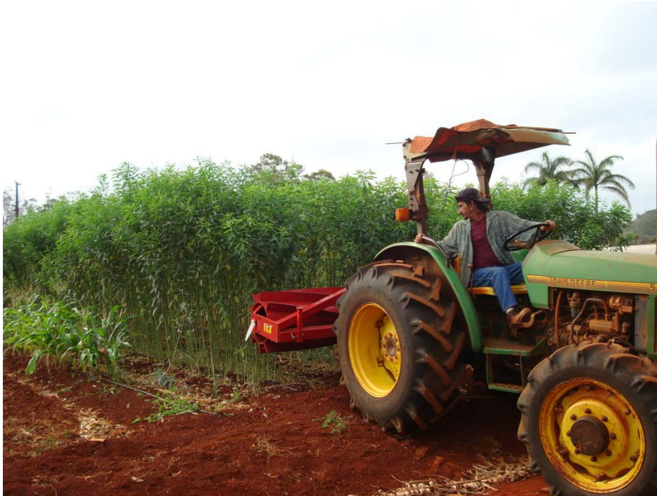
Fig. 2. Two-month old sunn hemp cover crop grown from May to July at Poamoho Experiment Station is ready for no-till rolling with the roller crimper.