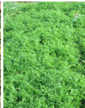
Wolly pod vetch