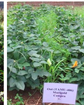
Cowpea + marigold