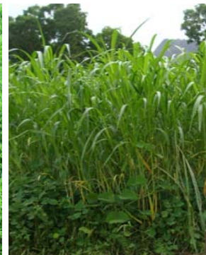
Sudangrass + lablab