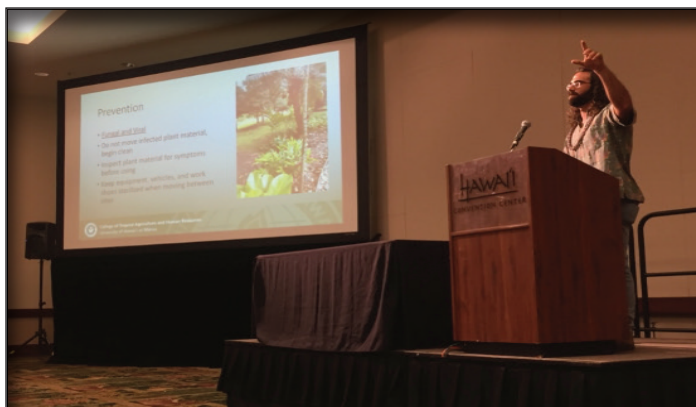
Seminar on red ginger decline to the landscape and nursery industries at the 2019 Landscape Industry Council's Annual Conference

A total of 524 industry stakeholders have been educated on the disease identification, characteristics, and management based on the current knowledge at conferences