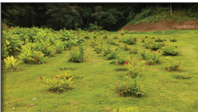
A severely infected plot of recently transplanted ginger

Red ginger ( Alpinia purpurata ) production in the state has been decreasing over the past five years. From 2014 to 2018, roughly one-third of the farms that reported income from red ginger no longer report that income, implying that these operations no longer grow red ginger substantially.