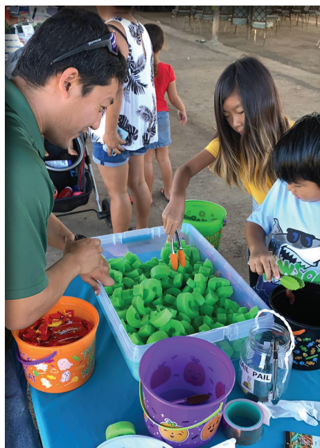
Slug Hunt Game

From 2017 to 2020, Extension conducted 19 grower trainings to address the food safety needs of agriculture