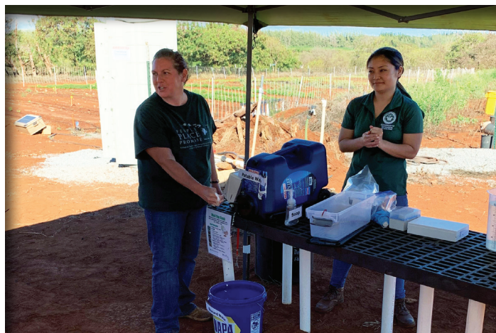
Portable Handwashing Station

Outreach materials and videos for water testing, sanitizers, slug and snail management, and other topics have been developed and are available to the public on the Farm Food Safety Team website (manoa.hawaii.edu/ctahr/farmfoodsafety).