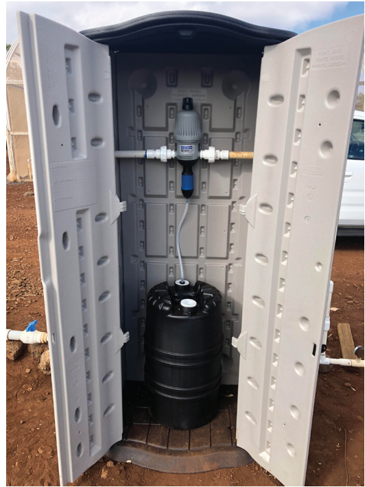
Field Water Sanitizer System

The CTAHR Farm Food Safety Team will continue to promote appropriate food safety practices and provide training materials to bolster community health and the agricultural sustainability of Hawai'i.