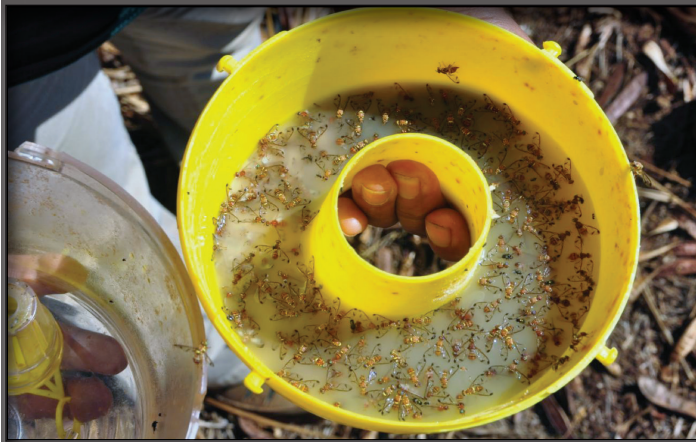
Melon fly monitoring