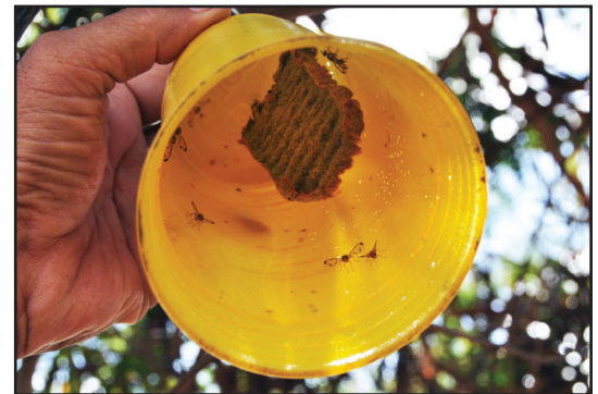
Melon fly control strategy

The idea behind the on-farm trial demonstrations was to have model farms with a successful melon fly control strategy to demonstrate to other growers that identifying melon fly roosting plants may increase the effectiveness of melon fly control.