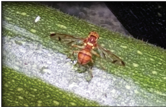
Melon fly laying eggs in zucchini

In Hawai'i, the melon fly is a major pest of cucurbit vegetables and tomatoes. Crop losses from melon fly range from 10 to 100%. Present control measures consist of using male annihilation cue-lure traps, GF-120 protein bait sprays, Amulet C-L bait stations, and sanitation and insecticide applications to the crop.