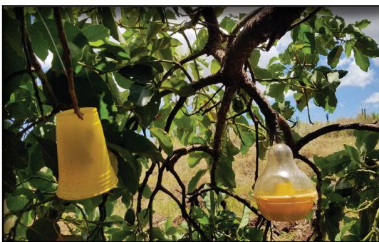
Melon fly traps set up

In July 2019, on-farm trial demonstrations (3 farms) were conducted in close proximity to zucchini field crops at Kula Agricultural Park to identify natural roosting host plants of the melon fruit fly and apply a control strategy. Thus, growers can learn by hands-on activities to identify