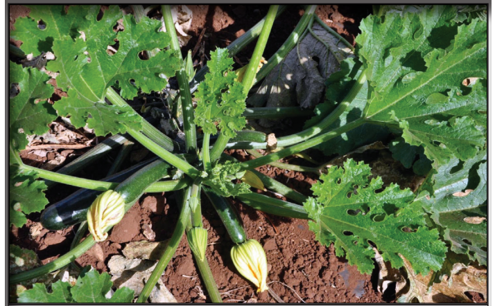
No damaged fruit