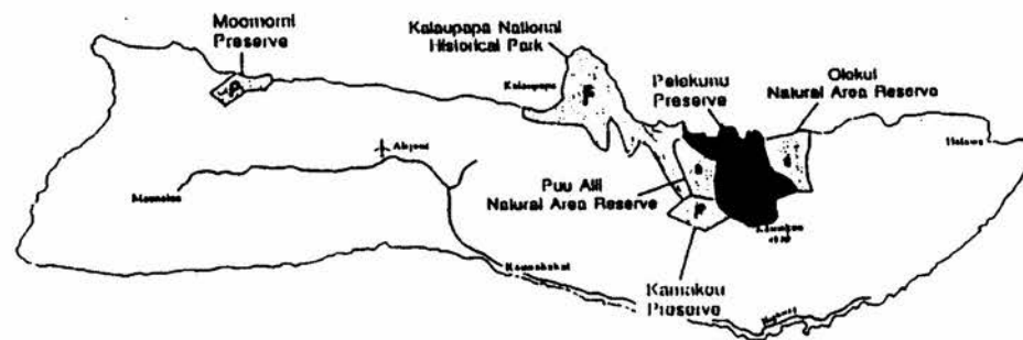
Figure 1. The Natural Area Partnership Program helps create opportunities for ecosystem management.