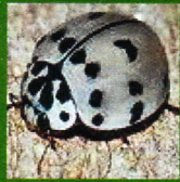
Ash-grey Ladybeetle ( Olla v-nigrum )

Food: Primarily psyllids, occasionally aphids Seen on: Papaya