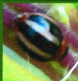
Three-striped Ladybeetle ( Brumoides suturalis )

Food: Aphid, whitefly, psyllids, scale, mealybug, and mites Seen on: Cilantro, cosmos, and crimson clover