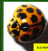
Common Spotted Ladybeetle ( Harmonia conformis )

Food: Primarily psyllids, occasionally aphids