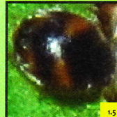
( Scymnus sp. )

Food Source: Aphids Seen on: Buckwheat, fennel, cosmos, crimson clover