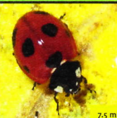
Seven-Spotted Ladybeetle ( Coccinella septempunctata )

Food Source: Aphids, thrips, whitefly, psyllids, leafhoppers, moths, beetles Seen on: Cilantro, fennel, dill