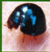
Black Chilocorus ( Chilocorus nigrus )

Food: Primarily psyllids, occasionally aphids Seen on: Papaya