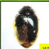
( Stethorus sp. )

Food Source: Mites Seen on: tea plants, papaya