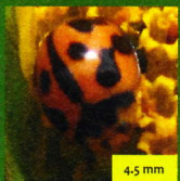
Variable Ladybeetle ( Coelophora inaequalis )

Food: Aphids, including milkweed aphid Seen on: Crimson clover