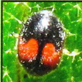
Minute Two-spotted Ladybeetle ( Diomus notescens )

Food Source: Aphids, mealybug, and some caterpillar eggs Seen on: Buckwheat, marigold, fennel, cosmos, crimson clover