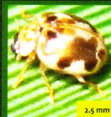
Twenty-spotted Ladybeetle ( Psyllobora viginti taedata )

Food: Powdery mildew Seen on: Zucchini, sunn hemp, papaya