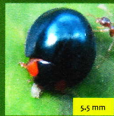
Metallic Blue Ladybeetle ( Curinus coeruleus )

Food: Scale, aphids, psyllids, mealybug, whitefly Seen on: Koa haole