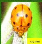
Variable Ladybeetle ( Coelophora inaequalis )

Food: Aphids, including milkweed aphid Seen on: Buckwheat, cilantro, cosmos, crimson clover