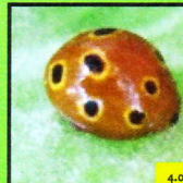
Ten-Spotted Ladybeetle ( Bothrocalvia pupillata )

Food Source: Aphids, whitefly, psyllids, thrips Seen on: Mamaki