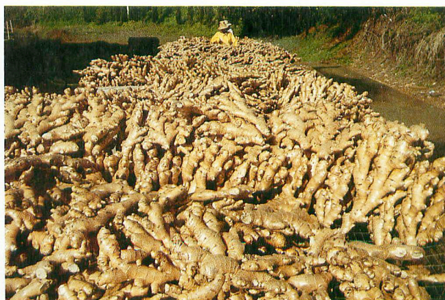
Figure 4. Harvested ginger roots being washed by hand.