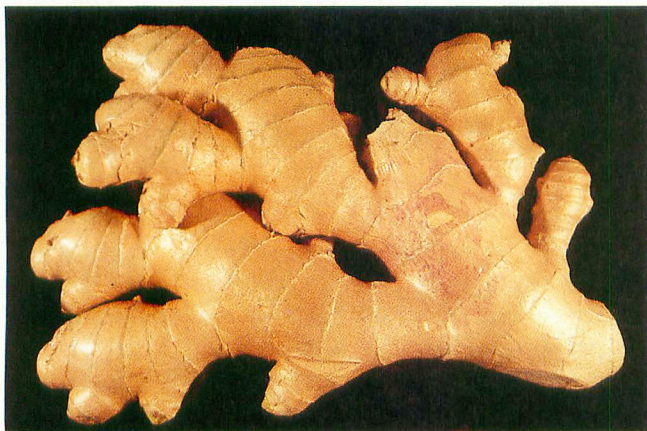
Figure 1. “Hand” of mature ginger root that has been cured.

About 2000 lb (907 kg) of seed is required to plant an acre of ginger with the average conversion ratio of seed to crop of 1:20. Seed size used in commercial production varies from 4 to 8 oz (113–227 gm), depending on the time of planting. The yield is not affected by seed size when planting occurs in early spring; however, late plantings benefit greatly from larger seed size. Increased seed density results in increased yield but also in an increase of tangled rhizomes, which creates problems in harvesting and in rhizome quality.