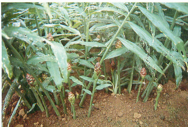
Figure 3. Ginger plants flowering in late September.

The natural senescence of ginger, which occurs in January, is triggered by flowering in late September, regardless of time of planting. Harvesting before senescence can be facilitated by trimming the tops of the ginger plant two to three weeks before the anticipated harvest date. This stimulates the formation of an abscission zone between the rhizome and the pseudostem.