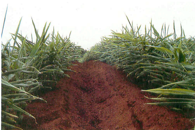
Figure 2. Young ginger plants that have been hilled with the aid of a tiller.