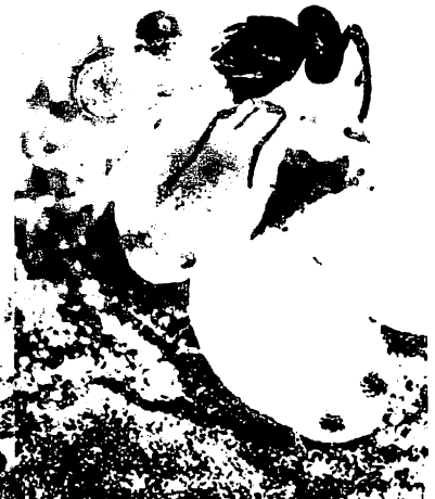
Dense infestation on papaya