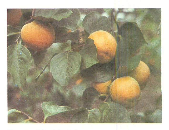
Figure 4. 'Maru' fruit cluster.