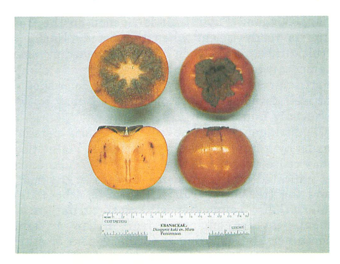
Figure 3. 'Maru' persimmon; internal discoloration, caused by curing, is normal.