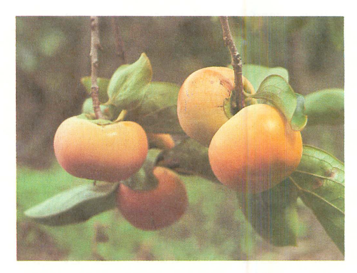
Figure 2. 'Fuyu' fruit cluster.