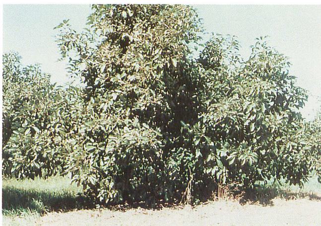
Fig. 1. 'Malama' tree.