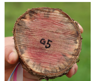
Above: Crown of infected tree, and ROD fungus staining patterns on 'ōhi'a cross-section lateral slashes.