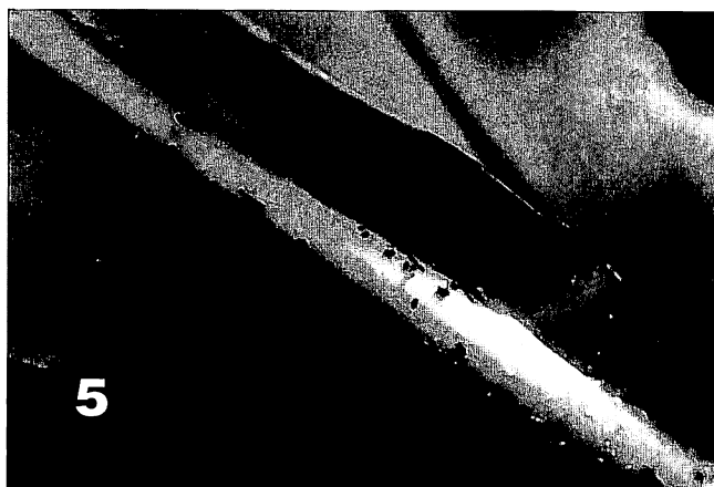
Aphids and ants, which tend them, on the petiole and lamina of the underside of a young banana plant leaf.

If the infected plant is tall and it is difficult to reach the upper petioles and unfurled leaf with the spray, it may be necessary to carefully cut and lower the plant to reach those parts. Cut a notch about \frac{1}{3} into the pseudostem, preferably on the side it is leaning toward, if that is a clear path to lower the plant. Then, carefully cut a slit with a sawing motion opposite and a few inches above the notch, until the plant starts to lean. If this is done carefully, the stem will not crash to the ground, thereby disburasing the aphids, but rather it will come down gradually to where it can be grabbed, steadied, and helped to descend. Spray for aphid control immediately, and then leave the plant undisturbed for about a day.