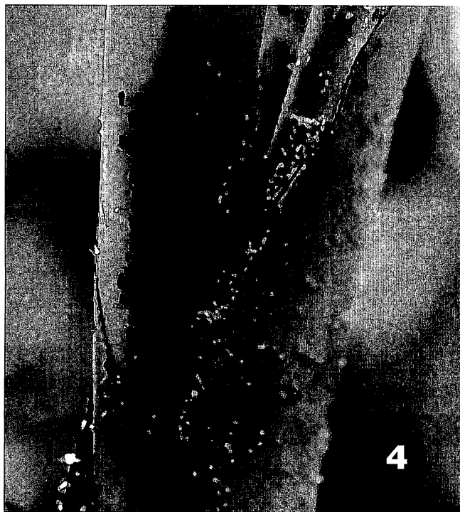
Aphids congregate and feed on the unfurled leaves of young banana plants.

Several commercial insecticidal soaps are registered for use in Hawaii. Consult your local garden shop for suitable products. In many situations, home-mixed soap sprays may be as effective as the commercial products, but they may contain additives toxic to plants. In addition, these home remedies are not legally registered as pesticides.