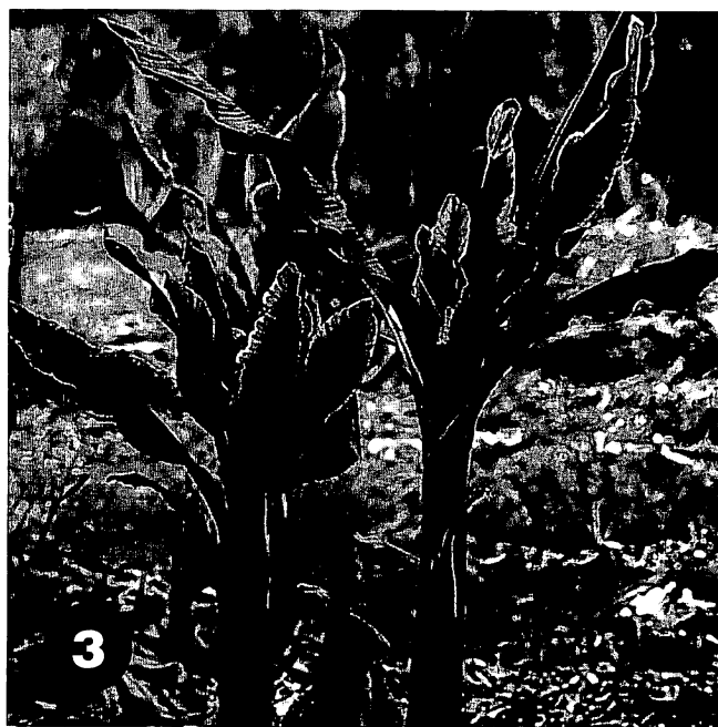
Young banana plants showing advanced symptoms of BBTV, including yellowed leaf margins and narrow, stiff, erect leaves "bunched" together at the top of the stem.

Aphids can be killed by spraying them with soapy water, and some insecticidal soaps are legally registered as pesticides. Insecticidal soaps have the advantage of being relatively non-toxic to people, birds, and other animals. The spray solution should be directed to the places where the aphids are most likely to be hiding or feeding. This includes the leaf petioles and the "pockets" where the petioles separate from the pseudostem. In particular, aphids can be found feeding on young suckers and down inside the whorl of the latest, unfurled leaf. After spraying the aphids, do not disturb the plant until the next day.