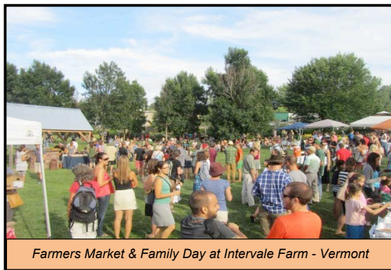
Farmers Market & Family Day at Intervale Farm - Vermont

One of the biggest untapped opportunities for small farmers is the creation of a Farmer’s Market in our farming community. This strategy addresses many key issues, one of which is to make fresh, healthy fruits and vegetables available for our neighbors, but is also about gaining support for agriculture in our community. Anyone who grows even a little garden can take advantage of the opportunity to make a little extra money.