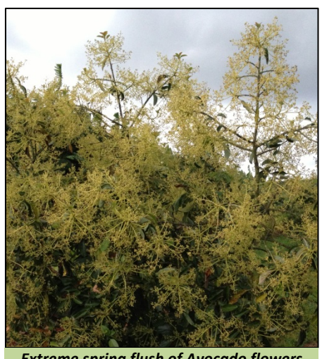
Extreme spring flush of Avocado flowers

I think spring is upon us, but it's difficult to tell at times. One day it's cold and rainy, and the next day it's sunny and hot, but at least it's changing. There's still some crazy weather on the mainland, and gusty winds along with torrential, flooding rains on Molokai, which really adds to the confusion of the seasons. These mixed signals are