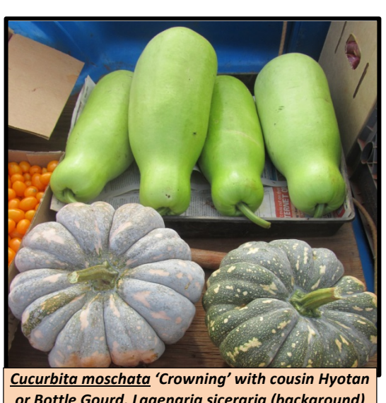
or Bottle Gourd, Lagenaria siceraria (background)

I've heard squashes referred to as 'eggs of the earth'. Squash is old stuff, and was domesticated before corn and beans over 8,000 to 10,000 years ago. It's native to a broad area from the southern U.S. to South America, and from there moved across the continent probably to Canada down to the Chile. Squash is a modern introduction in Hawaii, and Hawaiians considered squash one of the hidden fruits planted in the 'Huna' moon phase where the sharp tips of the moon 'huna' or hide. I consider it hidden treasure and vital for food storage and food security because with it, you can feed