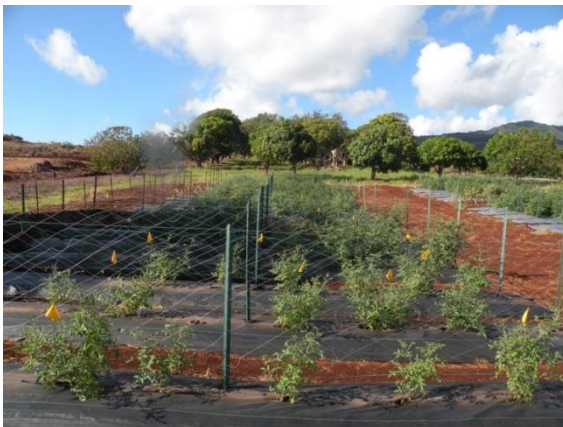
Black Plastic Mulch

Plastic mulches provide many positive advantages for farmers, such as increased yields, early maturing crops, crops of higher quality, enhanced insect management, and weed control. A tomato field trial was carried out at Poamoho Experimental Station from June to October 2015. The main objective of the trial was to assess the effectiveness of a silver reflective plastic mulch to suppress insect vectors of viruses, and other relevant pests in tomato. Two main viruses affect tomato production in Hawaii. Tomato Yellow Leaf Curl (TYLCV) is transmitted by the silverleaf whitefly, Bemisia tabaci , and Tomato Spotted Wilt Virus (TSWV) is transmitted by several species of thrips.