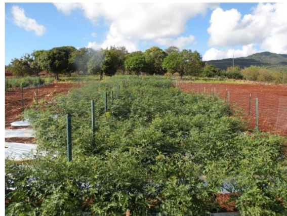
Reflective Plastic Mulch