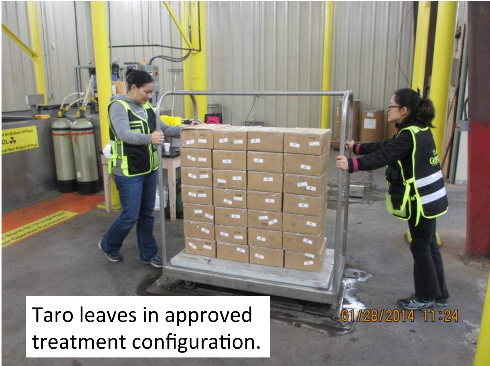
Taro leaves in approved treatment configuration.