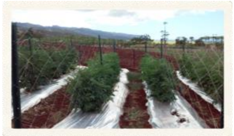
Reflective mulch, the plants are so much bigger than on the black mulch (previous picture). The pictures were taken on the same day and the plants were planted at the same time and were the same size at planting time. Reflective mulch increased growth, yield, and reduced pests.