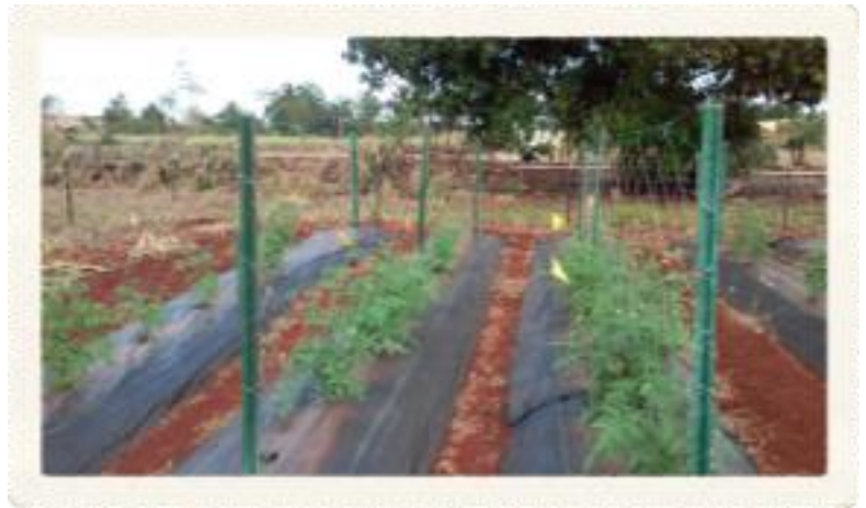
Tomatoes with black plastic mulch, contrast this with the next picture, reflective mulch. Reflective mulch (silver colored), increased yield and reduced pests significantly.

In conclusion, mulches can be an effective and sustainable pest control strategy that can reduce chemical inputs, improve yield, and increase soil and plant health. Use mulch in your garden or farm to obtain these multiple benefits.