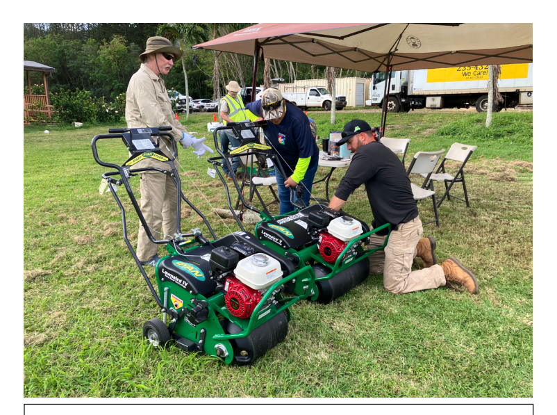
Students received hands-on training on maintenance and operation of the most common landscape maintenance equipment.

CTAHR Cooperative Extension partnered with the Landscape Industry Council of Hawai'i (LICH), Kauai Landscape Industry Council, Maui Association of Landscape Professionals, the Hawaii Landscape & Irrigation Contractors Association, and Windward Community College (WCC) to secure a workforce development grant ($190K in total). The grant funded the development and execution of a registered class at WCC (AGR7002) consisting of 12 classes and 2 field days. This is the first example of a Hawai'ibased concurrent statewide training program for the landscape industry. The program focused on Hawai'ibased topics like native and tropical plant identification, invasive species, tropical turfgrass management, soils specific to Hawai'i, among other specialized content that made it a more appropriate training for local audiences. The program awarded scholarships and enrolled 73 students from Kaua'i, O'ahu, and Maui. Forty-nine students passed the class and received landscape technician certification through WCC. Seven students have passed the national certification tests and are Certified Landscape Technicians through the National Association of Landscape Professionals.