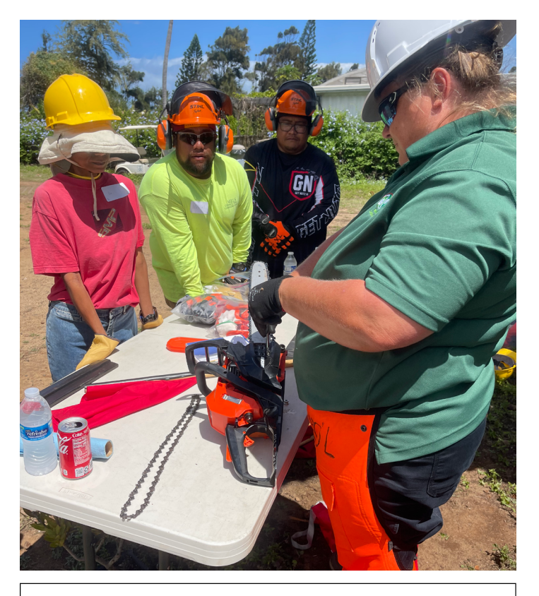
Safety training is one of the most important components of this training program.