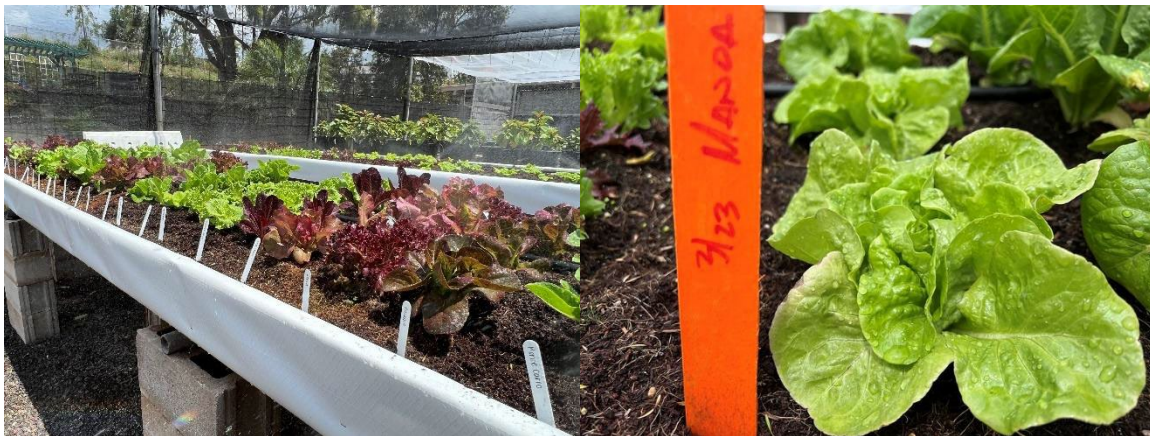
Photo 1. Lettuce grown under 40% shade. Photo 2. Manoa lettuce grown under shade and overhead irrigation.

When heat tolerant varieties are not available to growers, growth conditions can be modified. For example, Manoa lettuce is a highly sought after local favorite. However, it often exhibits tip burn under high temperatures. An observational field trial was conducted to determine if selected varieties could be grown under 40% black shade netting in order to re-purpose an old greenhouse system at the Urban Garden Center, in Pearl City. Seedlings were transplanted in February 2023 at 6-8" spacing between seedlings. The crop was harvested in April 2023.