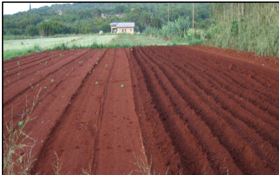
Molokai red gold can grow a wide variety of crops

Although some of these guidelines may not fit into your farming system, it's a good idea to incorporate as many of these guidelines in your farming system as possible. We need to create more GAPs or Good Agricultural Practices as we refine crop rotation systems for Hawaii.