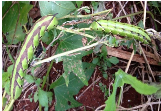
The Sweetpotato Hornworm is a destructive and erratic pest of sweetpotato, and can be identified by its dorsal horn. Population swings are due to cold weather impacting on its natural enemies.

I had intended to write a weather prediction for this summer, but I’ve given up on that idea after watching the weather over the last month. Important attributes of climate change include erratic, unpredictable, and extreme swings in weather. On Molokai, we’ve