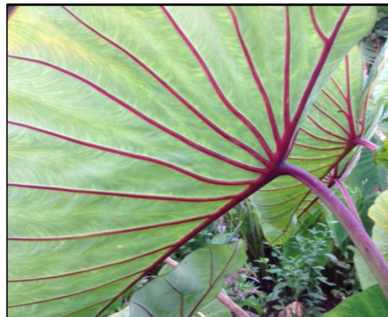
Taking water from one river source and distributing it through an entire valley to grow wetland taro required ingenuity and inspiration, and a lot of common sense!

The author was busy pursuing a career as a neuroscientist, a specialist on brain functions, so he left the vital task of caring for his paralyzed father to his