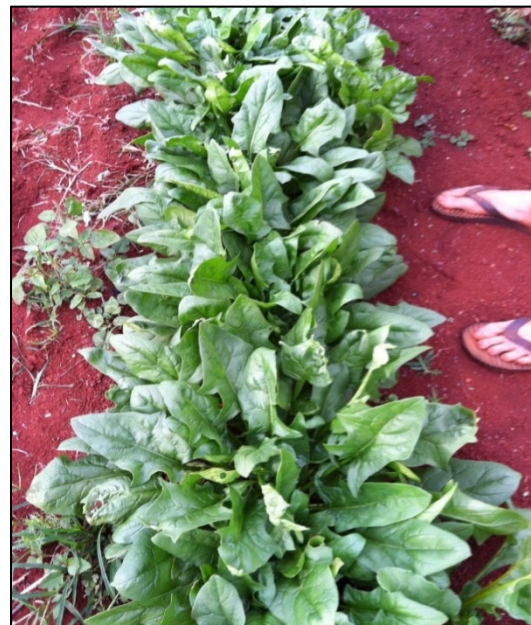
A whole lotta spinach and a little bit of weeds is where you want to be.

Most of the time, we don't have to find weeds. They dominate our existence as farmers, but what we do about them that really matters. I'm dealing with more than my share and haven't seen so many weeds in my life as I've seen