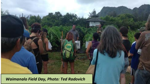
Waimanalo Field Day

into poi. These activities help bring to light other Hawaiian cultural, health, and socio-political issues, and these activities enhance communication and networking within pockets where Hawaiians live throughout the state.