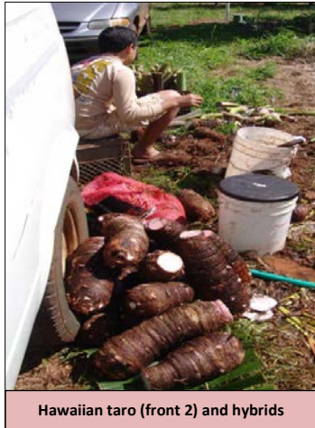
Hawaiian taro (front 2) and hybrids