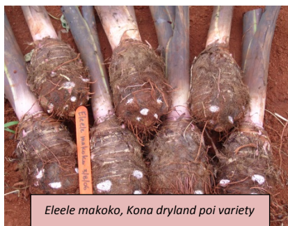
Eleele makoko, Kona dryland poi variety

I grow hybrids because I believe it's a matter of survival or food security on our little island of Molokai, but I also grow Hawaiian varieties as a barometer or a standard that I can set. I grow over 25 varieties of taro, and I also believe that we need to protect ourselves much like the Hawaiians did in constantly improving their taro. It's better to have some taro to eat than none at all. But that's me, and everyone has their own rationale for what they do. I plan for the storms, and it's not a matter of 'if', but 'when', but I continue to plant more Hawaiian varieties because that's what the markets are asking for.