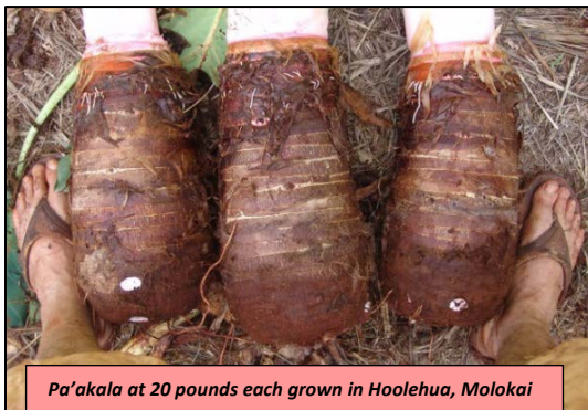
Pa’akala at 20 pounds each grown in Hoolehua, Molokai