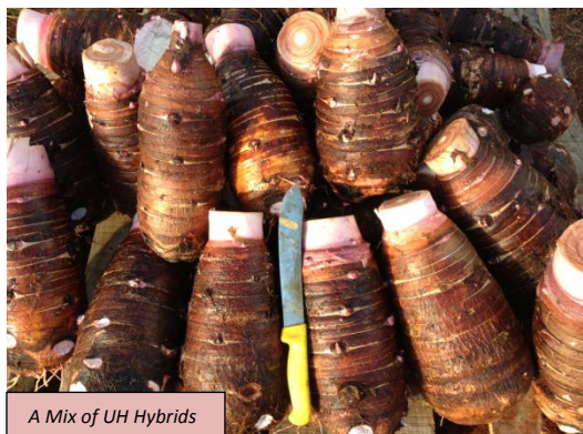
A Mix of UH Hybrids