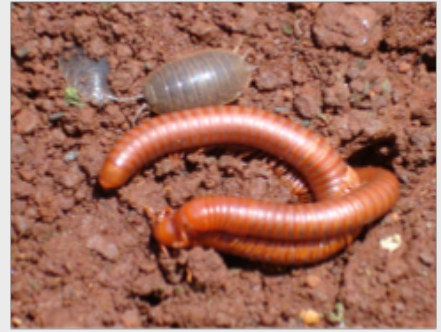
Isopods and millipedes