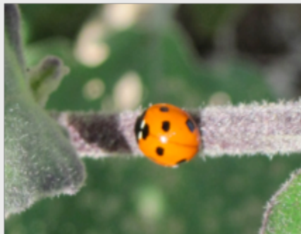
Lady Beetle