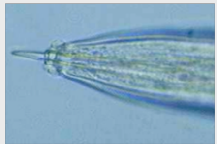
Omnivorous nematode