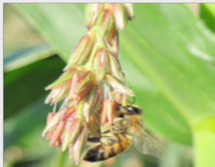
Honey bee collecting corn pollen.