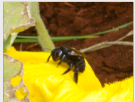
Carpenter bee on kabocha squash flower.