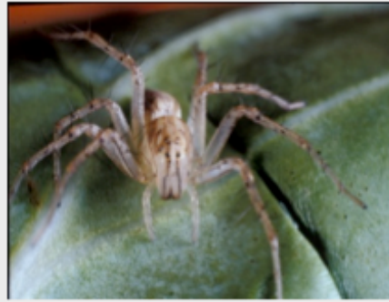
Lynx spider