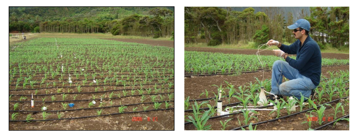
Figure 1. Overview of experimental plots at the Waimanalo Research Station, with two suction cup lysimeters in each plot.

Two suction cup lysimeters were installed in each plot within and below the crop root zone, at 30 and 60 cm depth, respectively. SPAD device was used to measure RCC in sweet corn leaf. Soil solution samples were analyzed for NO<sub>3</sub>–N concentration using chromotropic acid method.