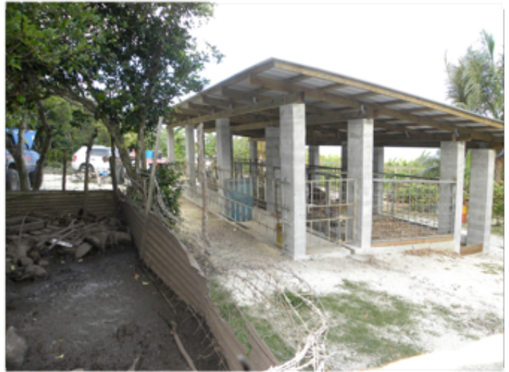
Figure 1. Photograph of the first USDA Natural Resources Conservation Service Environmental Quality Incentive Program funded Modified Dry Litter System installed on the island of Tinian, Commonwealth of the Northern Mariana Islands. Bottom left corner of the photograph shows the old pig pen.

With the sloping floors (and gravity) of the dog kennel, and with a pig’s natural grubbing and hoof actions, the bedding material could flow out of the pen into a (waste) holding area,