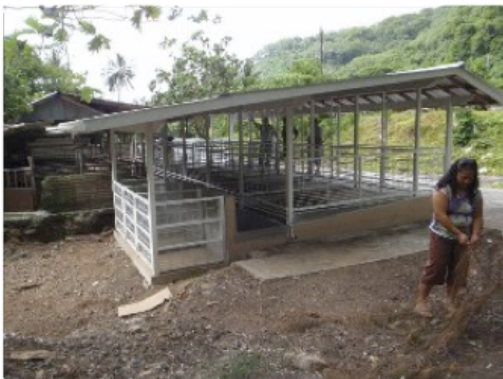
Figure 3. Photograph of the first EQIP installation on the island of Tutuila, American Samoa. There are six pens and three composting bins built into the unified structure.

The Modified Dry Litter System and alternative dry litter systems are CTAHR derived innovations. Through our assistance and relationships with our producers in the states, many creative and innovative contributions have been made to small-scale tropical agricultural production methods, such as the example of dry litter technology. I like this quote, shared by Kauai extension agent Matt Stevenson, because it truly sums up the work of the extension agent. "The extension work job is not obscure, intricate, involved, or necessarily difficult. It is simple and full of joy of doing things that give immediate help." (Quote from a 1929 Extension Report "Agricultural Extension Work in Hawaii by William Lloyd, Dean, Agricultural Extension Service).