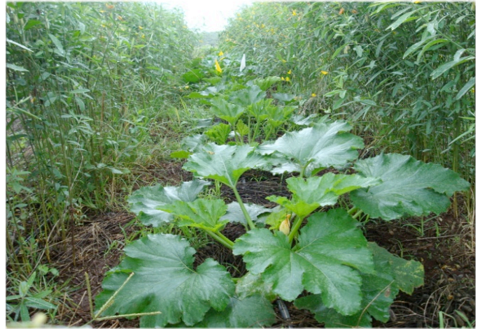
Picture 1. Strip-till cover cropping of sunn-hemp in a zucchini cropping system.

Short-term vegetable crop production often involves frequent tillage and other farm activities that result in disturbed soil food web communities. The warm tropical climate of Hawaiian Islands allows farmers to have year-round production of multiple short-term crops in the same field, which makes the agroecosystem highly vulnerable to this disturbance. A less disturbed soil community would have more structured soil food web which contains soil organisms higher up in the food web pyramid with improved soil nutrient cycling.