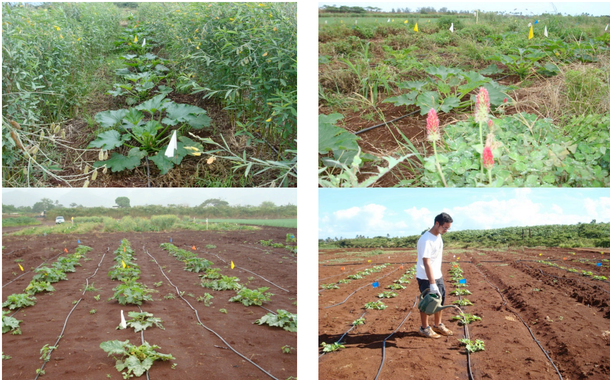
Picture 2. Zucchini plants grown in strip-till cover cropping system A) sunn hemp, and B) crimson clover; C) a bare ground system and D) Zucchini plants, drenched with chicken manure based vermicompost tea at weekly in-

Plants receiving CT treatment were drenched with 120 ml/plant of chicken manure-based vermicompost tea at weekly interval until beginning of fruit harvest (Picture 2 D). Compost water