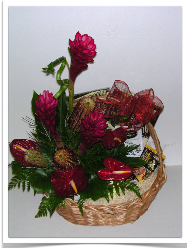
Gift basket with tropical and Hawai'i products

One last note, the University of Hawai'i is one of only 100 remaining Land Grant Universities. It is essential to have the support for CTAHR by producers and the University. The University of Hawai'i is here because of the Land Grant system and the three-legged stool of education, research, and extension makes us different from other institutions. We must have the extension programs strengthened so that Hawaii's agriculture can help farmers make Hawaii's production more sustainable.