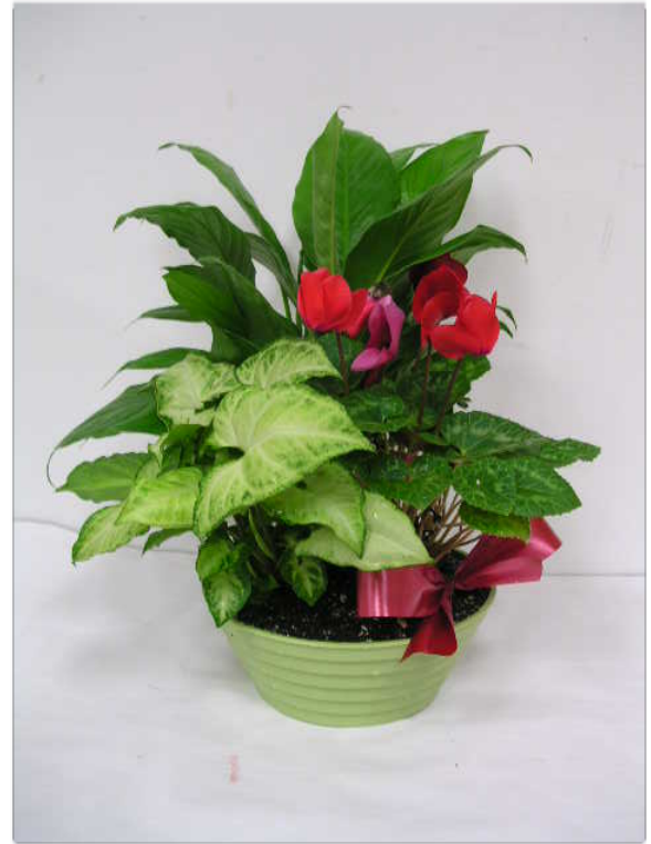
Small dish garden by Alluvion, Inc.

One cannot sell from an empty cart. Thus, having weekly production is essential. Because we are always looking for quality materials, we do charge a little more for our products. Selling beautiful, healthy plants and arrangements is our goal. Our mission statement is: Alluvion de-