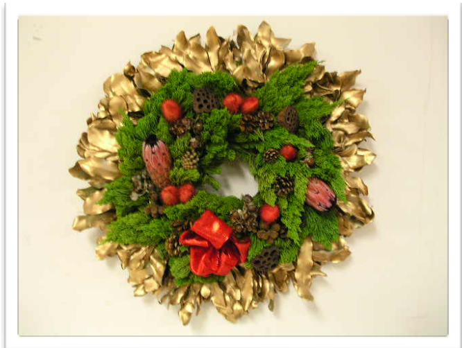
Hawaiian wreath made from macnut leaves and pods

Hawai'i is such a small place and unless we all work together, we cannot be sustainable. The coordinating entrepreneur concept insures that we can be a "consistent supplier of quality products". Like the produce business, we cannot have product one day and have nothing the next. The needs of having certain products available for the marketplace each day is one that Hawai'i growers must come to realize.