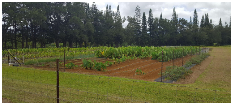
A taro field protected by pinetree/ironwood windbreaks.