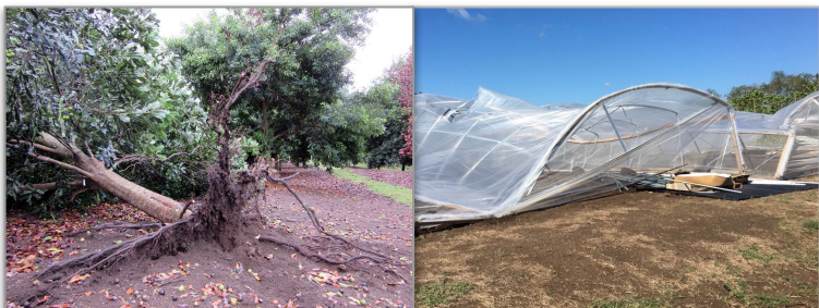
Orchard crop and farm structure wind damage.