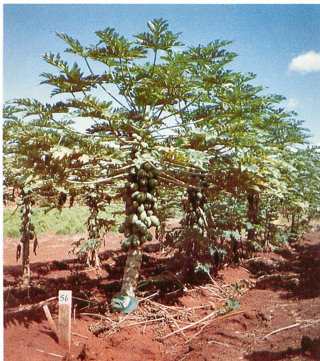
Fig. 1. 'Sunset' plant.