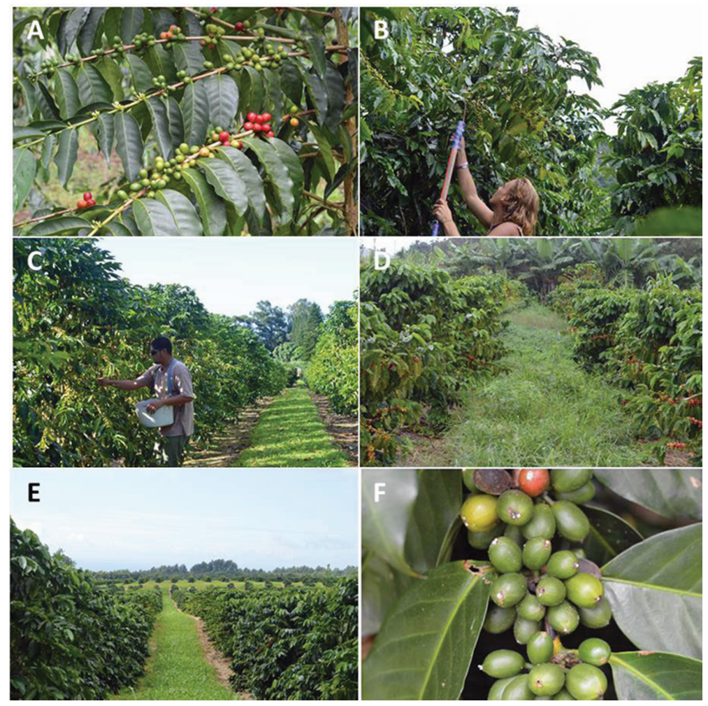
Figure 4. Coffee tree with berries at developmental stages from flowering to maturity ( A ); tall trees with many verticals and narrow spacing (<2 m) makes collection difficult ( B ); trees with <4 verticals and spacing >2 m simplifies harvest ( C ); weeds obscure fallen berries ( D ); weed management facilitate harvesting ( E ); CBB in AB position infected by B. bassiana ( F ); Photos taken in Pahala, Hawaii, by Libia C. Mahé, and Luis F. Aristizábal.

Similar reports have emerged from other countries where cultural harvesting (re-picking) is implemented. In Brazil [96] and Guatemala [70], improved CBB control occurred when re-picking after harvest was conducted. In Mexico, the re-picking practice was as effective as two applications of insecticides in the control of CBB [71].