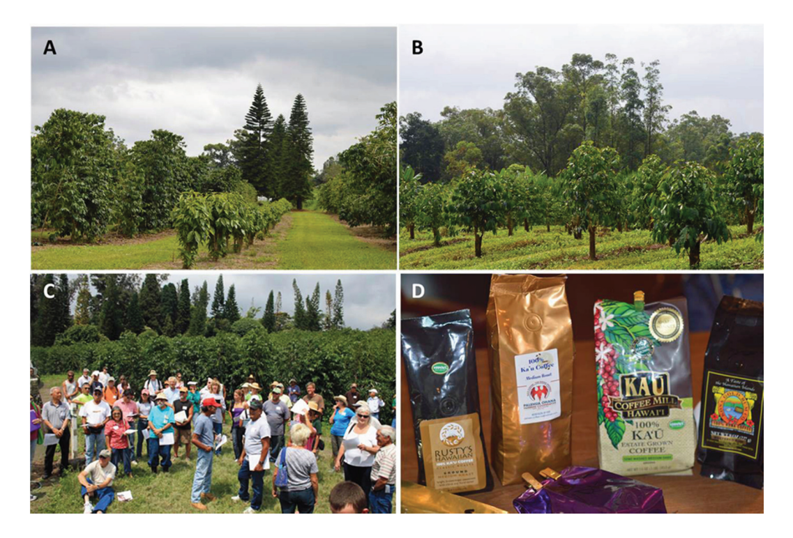
Figure 6. Traditional Kona-style and Beaumont-Fukunaga pruning ( A ); stump pruning by blocks ( B ); training coffee farmers and technicians on IPM ( C ); coffee brands produced in Kau and Kona, Hawaii ( D ). Coffee plantations in Pahala and Kona, Hawaii.

In Hawaii, rejuvenation practices known as "Kona Style System" and "Beaumont-Fukunaga System" [39,170], allow pruning by rows of mixed age coffee trees to simplify management and harvesting (Figure 6A,B). Those practices need to be re-examined under the presence of CBB, since a combination of old and new coffee trees in the same lots may promote the dispersal of CBB.