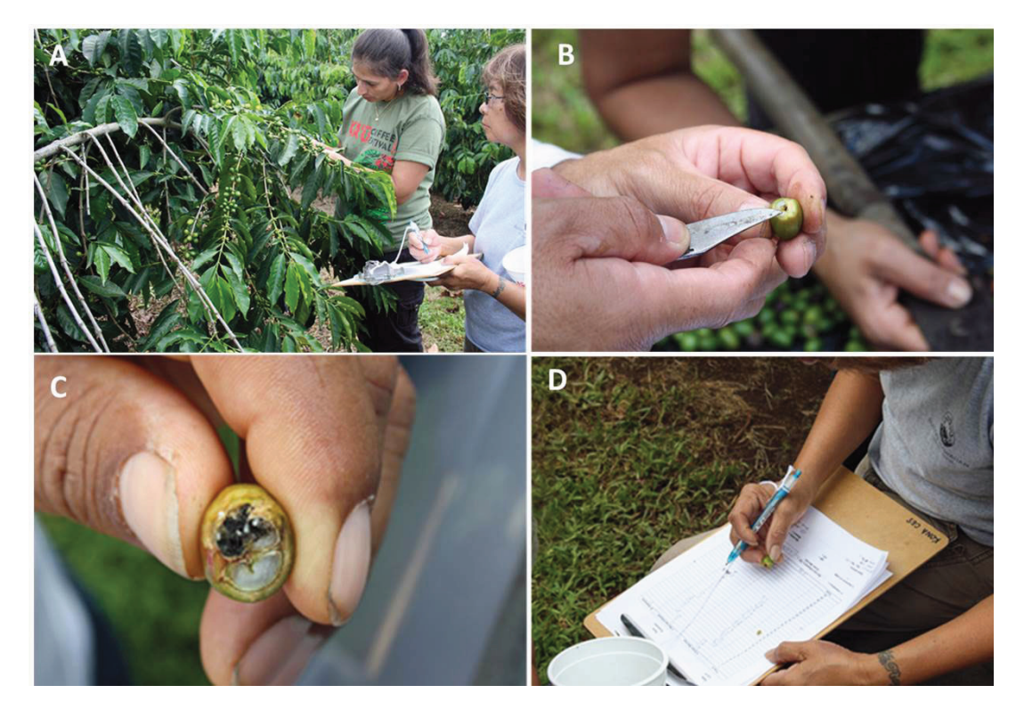
Figure 2. Evaluating the infestation levels of CBB ( A ), in position AB the CBB is vulnerable to insecticides ( B ); in the CD position CBB only can be controlled by removal of berries or natural enemies ( C ); recording the information ( D ). Photos taken in Pahala, Hawaii by Juan A. Aristizábal and Luis F. Aristizábal.