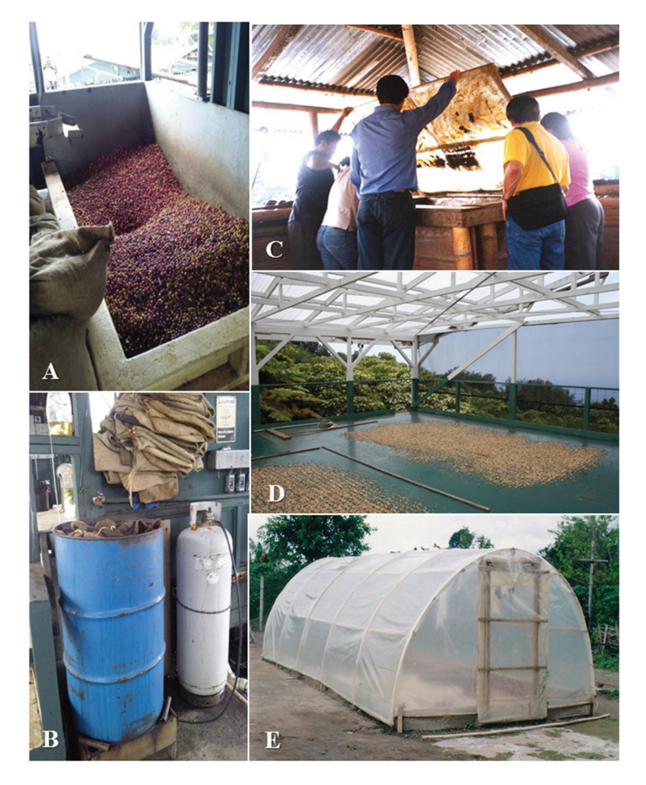
Figure 5. Silos used to process harvested coffee without cover allows escape of CBB ( A ), container with hot water to control CBB in harvest bags ( B ); silo cover with transparent plastic smeared with grease to capture CBB in Colombia ( C ); drying parchment coffee in open areas allow escape of CBB ( D ); and enclosure for dry parchment coffee used to prevent CBB escape in Colombia, ( E ). Coffee plantations in Kona, Hawaii and in Quimbaya, Colombia.

escape from processing facilities [64,126]. Alcohol-traps can also be used in processing areas to capture residual CBB. There are opportunities to improve post-harvest control in Hawaii (Figure 5).