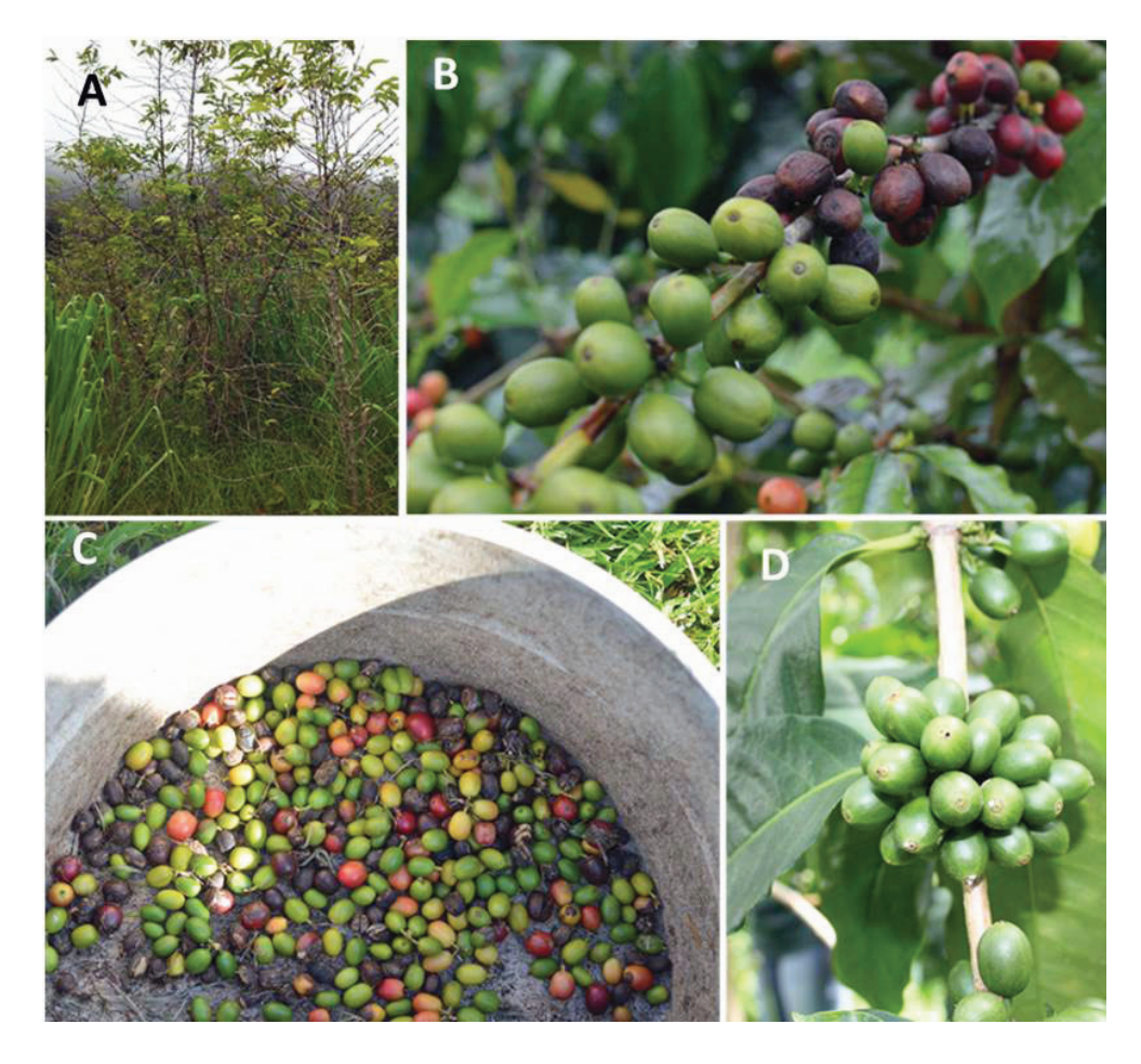
Figure 1. Feral coffee in Hawaii may allow the spread of CBB, ( A ); over-ripe and raisin berries are high source of CBB ( B ); berries collected from the ground helps control CBB ( C ); green berries attacked by CBB ( D ). Photos taken in Pahala, Hawaii by Libia C. Mahé, and Luis F. Aristizábal.