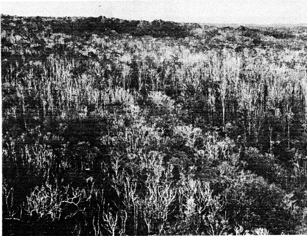
This heavily diseased portion of an ohia forest is typical of thousands of acres of forest decline on the island of Hawaii.